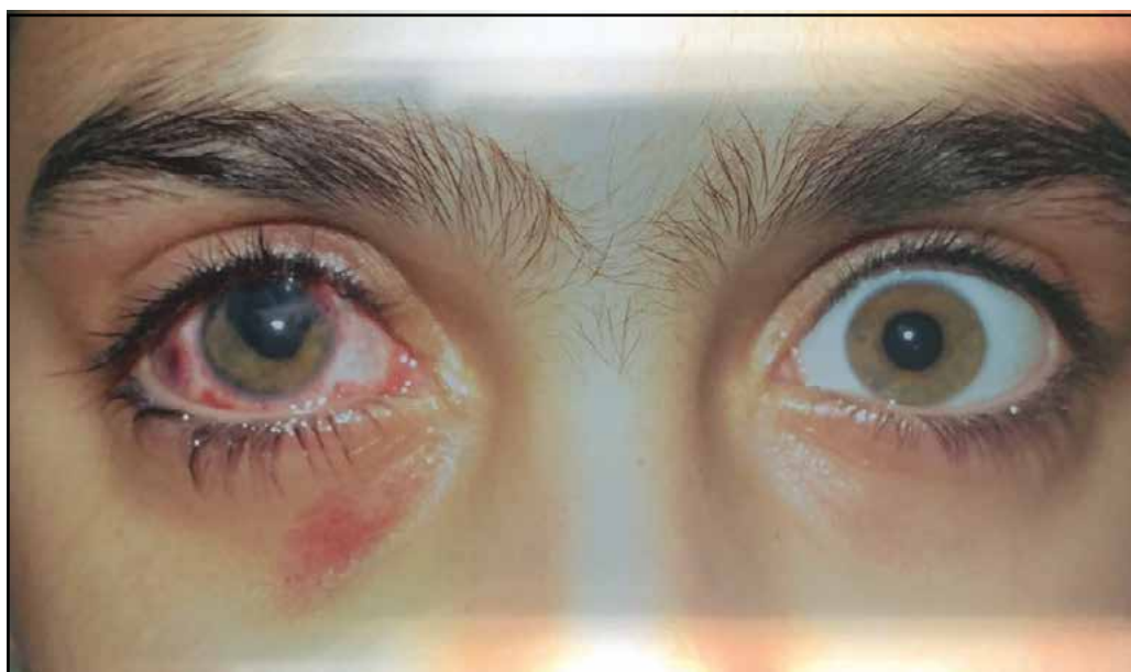
Fig. 2. Photograph of child's eyes after pole-to-pole surgery