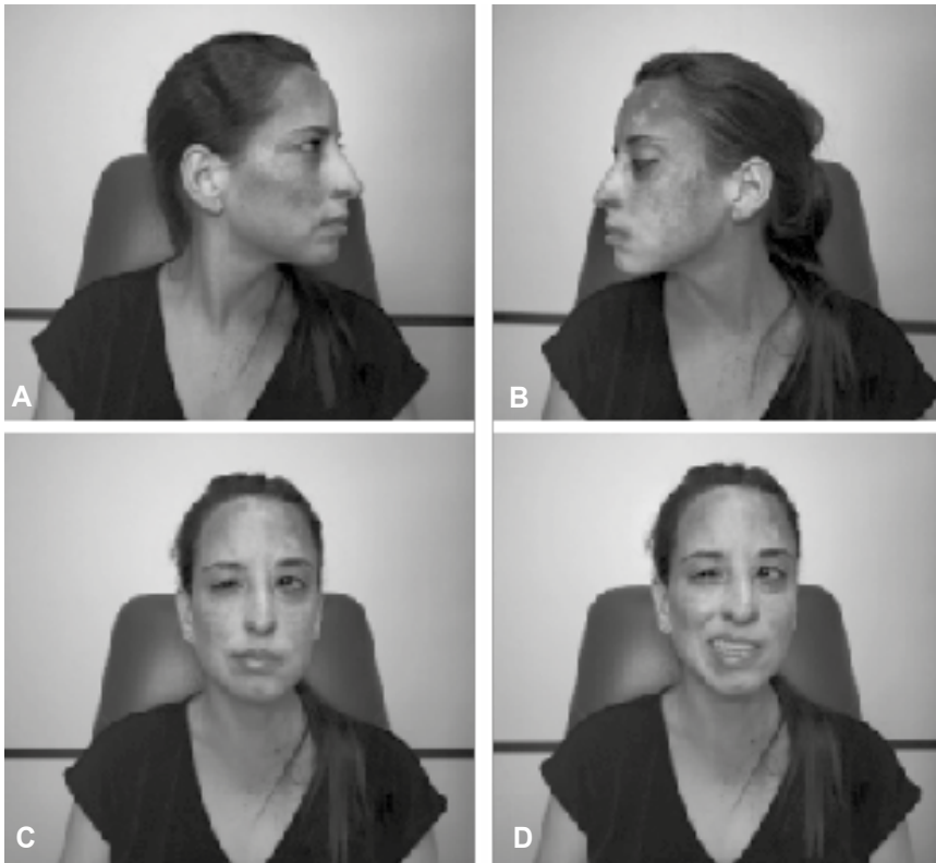
Pic. 1. Patient before treatment. A – nevus of Ota on right side of the face. B – nevus of Ota on left side of the face and a scar on the left nasal septum. C – an esotropia of 50 prismatic diopters left eye. D – left facial hemiparesis.