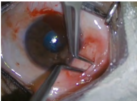
Figure 1. Ironing of graft

Peribulbar anesthesia with 2% lignocaine was given preoperatively. The body of the pterygium was dissected 4 mm from the limbus, down to the bare sclera. Pterygium was removed from the cornea by avulsion. Only the thickened portion of the conjunctiva and the immediately adjacent and subjacent Tenon's capsule were excised. Large